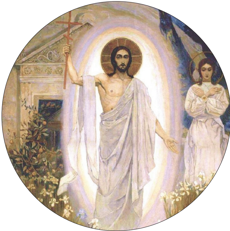
Resurrection, Mikhail Nesterov, 1862-1942

9:00 a.m. Low Mass | 11:00 a.m. Solemn Mass