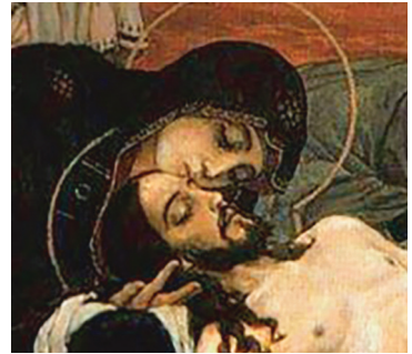
“The Death Shroud,” Viktor Vasnetsov, 1896