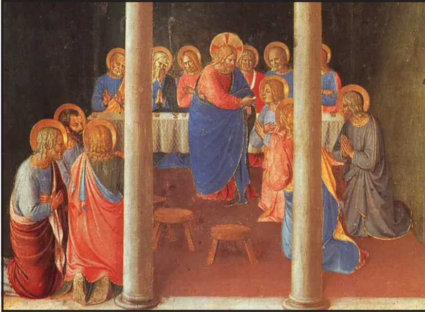
The Last Supper: Communion of the Apostles, Fra Angelico (1395-1455)